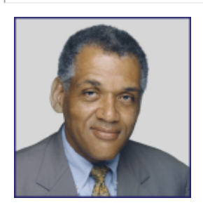
Director since 2020 Age: 76*