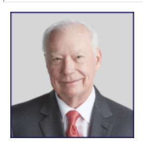
Director since 2020 Age: 76*